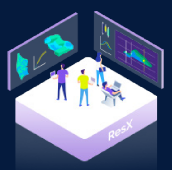
Fit-for-purpose machine learning algorithms augmenting the know-how of the subsurface team.

Improve your reservoir modeling efforts with highly efficient algorithms.